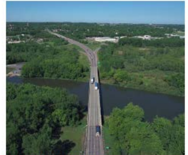
Minnesota River Bridge