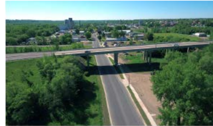
Front Street Bridge