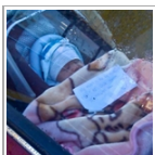
Shopping Mother Leaves Baby in Car with a Note