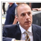
Matt Lauer's Possible Firing from Today Show