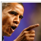
Major Crash Ahead For U.S. Investors