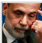
U.S. Economy May Fall Into A "Death Spiral"