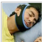
A New Solution That Stops Snoring and Lets You Sleep