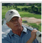
How to Bring Out the Great Golfer Inside You